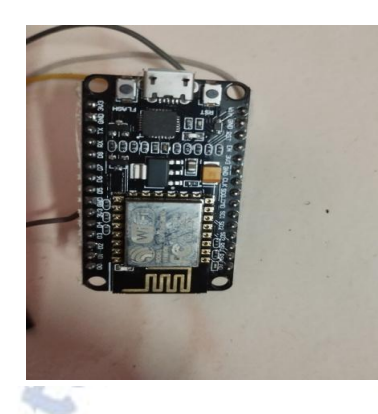
Fig. 1 Wi-Fi module

An ESP8266 Wi- Fi module is used for internet connectivity which sends the parking lot's data to a cloud where general public can view the data in real time. A power force module is employed which provides 5V and 3.3 V for Arduino, Ultrasonic detectors and ESP8266 Wi- Fi Module.