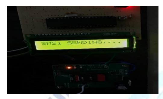
Fig 5 After detecting the block, the message is sent to the higher authority inmunicipality.