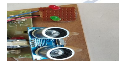
Fig. 2 Ultrasonic sensor

An Ultrasonic Sensor is used to descry and avoid the obstacles comes in front of the robot. It's connected in the receiver side. Ultrasonic detector is used measure the distance within a wide range of 2 cm to 400 cm. The Ultrasonic transmitter transmits a surge, this surge peregrination in a Ultrasonic and when it gets expostulated by any material. There are three Ultrasonic detectors for detecting 3 vehicles on the parking spot, we're using Ultrasonic detectors rather of IR grounded detectors because if the parking lot is positioned outside, infrared light from sun may intrude with IR detectors and may give incorrect discovery of the vehicle, whereas Ultrasonic detector acts like a mini radar and environmental factors affecting its functionality is minimum.