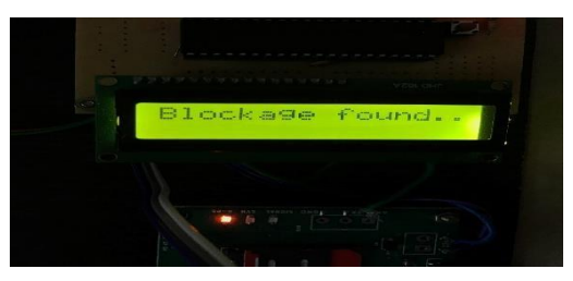
Fig 3 block detection in the pipe