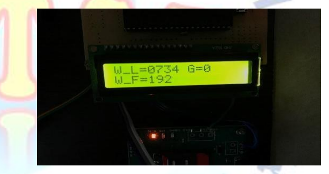
Fig 2 When there is no

Water position W_F Water inflow G Gas Figure 2 When there's no blockage in the drainage pipe, there will be a smooth inflow of the drainage water. The water inflow detector will descry the Figure 3 When there's a blockage inside the drainage pipe, the water position will increase. But there won't be the water inflow. So either the inflow will drop or it'll come 0 and only the water position increases. water inflow and the position detector also measures the water position inside the pipe. 0 in the gas indicates there's no conformation of methane gas inside the drainage pipe. Fig5 After detecting the block, the communication is transferred to the advanced authority in megacity.