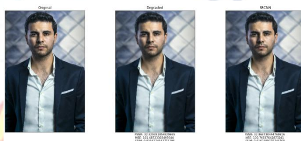
Figure 2 : Image 1

This paper used Super-Resolution Convolutional Neural Network to enhance the degraded image. In the proposed method, SRCNN learns an end-to-end mapping between low-resolution and high-resolution images, with no additional pre/post-processing than optimization. We have achieved superior performance with its lightweight structure than the state-of-the-art methods. Test output by using the SRCNN method is shown below: