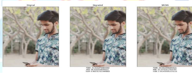
Figure 3: Image 2