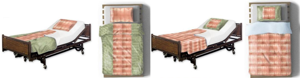
Fig. V.C-g (Peppermint dyed fabric bed collection+ Pomegranate skin dyed fabric)