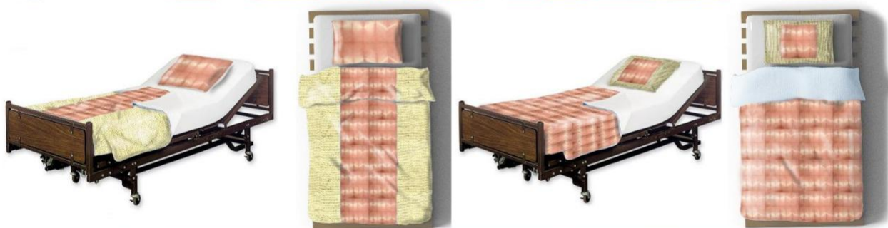
Fig. V.C-e (Turmeric dyed fabric bed collection+ Pomegranate skin dyed fabric)