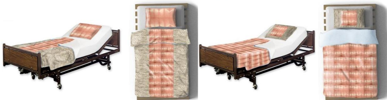
Fig. V.C-f (Turmeric dyed fabric dipped thrice in neem solution + Pomegranate skin dyed fabric - bed collection)