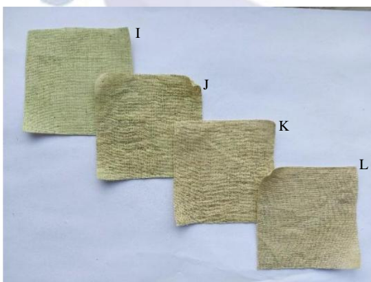
Fig. V.B.2-c, Peppermint dye with neem treatment

Pomegranate skin dyed fabric dipped thrice in neem solution and dried.