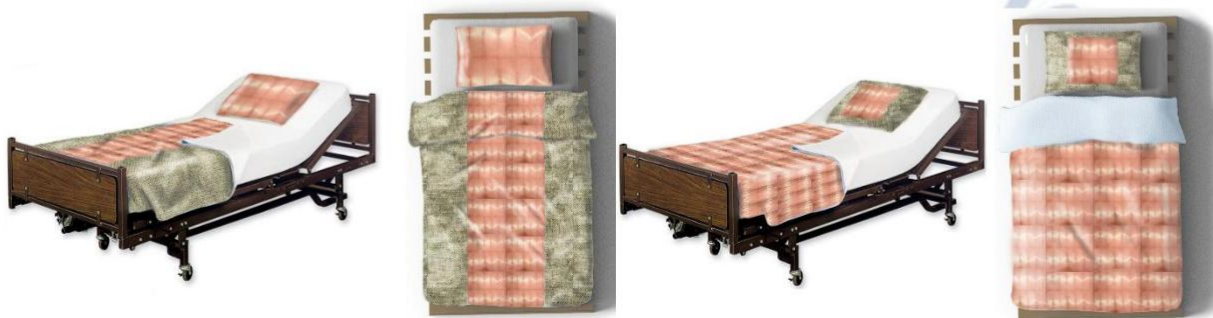
Fig. V.C-h (Peppermint dyed fabric dipped thrice in neem solution + Pomegranate skin dyed fabric - bed collection)