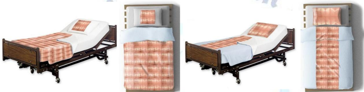
Fig. V.C-d (Pomegranate skin dyed fabric)

The prototype of the bed collection using the above-mentioned process is shown below (Figures- V.C-d, V.C-e, V.C-f, V.C-g, V.C-h)