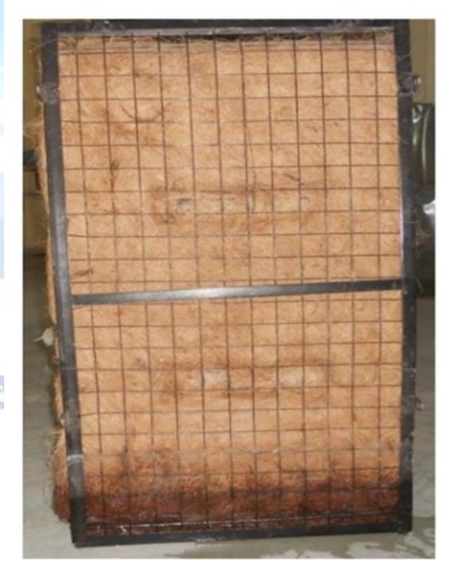
Figure 6.evaporative pad