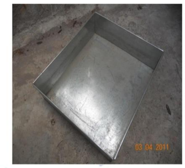
Figure 5.Water Tank

Pad: A cooling evaporative pad, also known as a swamp cooler pad or cooling pad, is a device used in evaporative air coolers. It's typically made of a special cellulose material that absorbs water. When air passes through the pad, the water evaporates, cooling the air in the process. This cooled air is then blown into the room, providing a refreshing cooling effect. It's an energy-efficient way to cool spaces, especially in dry climates.[5]