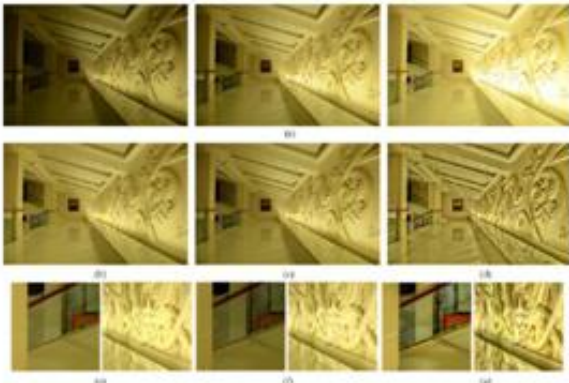
Fig. 3. Performance comparison on the agent sequence with the exposure fusion approach [27] and the gradient directed fusion approach [27]. (a) Input sequence. (b) Result by [27]. (c) Result by [27]. (d) The result. (e) Close-up of (b). (f) Close-up of (c). (g) Close-up of (d).

increases nonlinearly before and after the boosting process (Fig. 3, bottom row). Our boosting method preserves the structure and texture details so as to get a natural and visually pleasing fusion result.