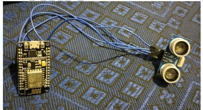
Figure 4: Circuit Diagram 5.2:Tank Water Monitoring System

Here is a circuit diagram for Interfacing Ultrasonic Sensor with NodeMCU ESP8266. There are 4 pins in (GND,VCC,TRIG,ECHO. The 4 pins in Ultrasonic is connected to the NodeMCU.