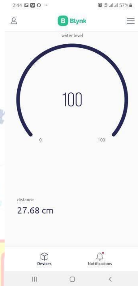
Figure 7: Water Level Form

In the tank water monitoring system experiment, various parameters were investigated to assess the system's performance. Key metrics included water level accuracy, response time to level changes, and reliability in different environmental conditions. The experimental results indicated that the system demonstrated precise water level measurements with minimal deviation. Additionally, it exhibited a rapid response to changes in water levels, showcasing its efficiency in real-time monitoring. The system's robustness was evident as it maintained consistent performance across varying environmental factors such as temperature and humidity. Overall, these findings suggest promising outcomes for the practical application of the tank water monitoring system in ensuring accurate and reliable water level assessments.