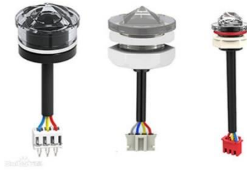
Figure 2 : Water level Sensor

Floating on the water's surface, triggering a switch when the water level rises or falls. Pressure transducers measure water pressure at a specific depth, while ultrasonic sensors use sound waves to determine the distance between the sensor and the water surface. The choice of sensor depends on the application and environmental factors. Water level sensors find applications in industries like agriculture, environmental monitoring, and wastewater management, providing crucial data for efficient water resource management.