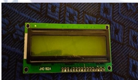
Figure 3 : Liquid crystal display(LCD)

While liquid crystal displays (LCDs) are not typically used directly in tank water monitoring systems for level sensing, they can play a crucial role in the user interface or display unit of the monitoring system. The actual water level measurement is often facilitated by sensors such as ultrasonic sensors, float switches, or pressure transducers.