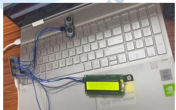
Figure 5: Connection of MCU to the Ultrasonic Sensor

It is recommended To set up a tank water monitoring system, you typically need sensors, a microcontroller (like Arduino or Raspberry Pi), and connectivity components. Connect the water level sensor to the microcontroller, power it appropriately, and establish communication (e.g., GPIO pins). Use Wi-Fi, GSM, or other modules for remote monitoring. Program the microcontroller to read sensor data, and consider using a cloud service or local server to store and analyze the information. Ensure proper grounding and follow the specifications of your components for accurate readings..