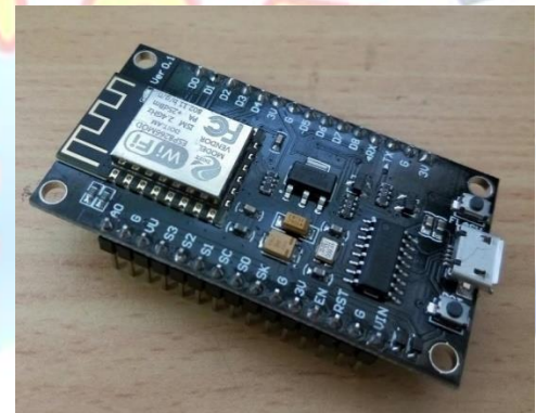
Figure 1: NodeMCU ESP8266

The NodeMCU ESP8266 development board comes with the ESP-12E module containing the ESP8266 chip having Tensilica Xtensa 32-bit LX106 RISC microprocessor. This microprocessor supports RTOS and operates at 80MHz to 160 MHz adjustable clock frequency. NodeMCU has 128 KB RAM and 4MB of Flash memory to store data and programs. Its high processing power with in-built Wi-Fi / Bluetooth and Deep Sleep Operating features make it ideal for IoT projects.