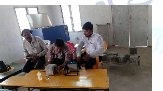
Fig 1 UPV cube testing Table 10 Ultrasonic pulse velocity of concrete mixtures(cement + Brick po<mark>wder+</mark>metakaloin)