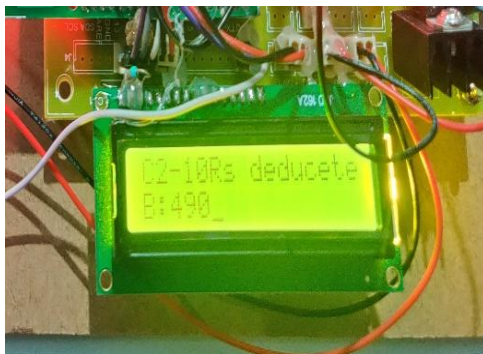
Fig.4 Shows the parking slot and payment method

The below diagram shows the status of the parking zone when a single vehicle is parked in the parking zone. Once when the user enters the parking detect sensor he would receive a parking slot number on his mobile application which he is supposed to park his vehicle. On before entering the parking slot the RFID reader can scan user card and detect the amount in both the mobile application and the 16*2 display LCD.