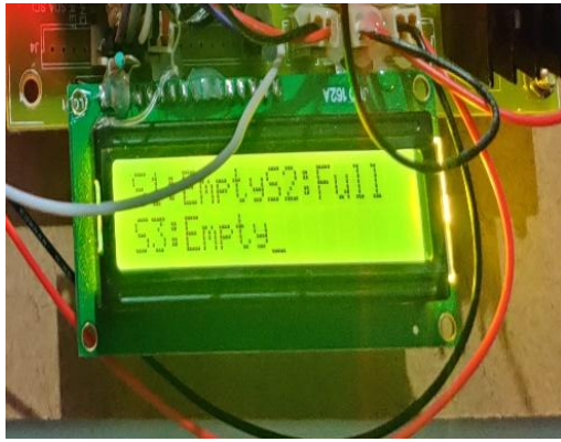
Fig.3 Shows the empty parking slots