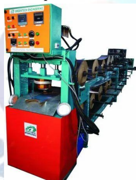
Fig.1.2. Fully Automatic Paper Plate Making Machine

This machine is fully automated and can produce paper plates of various sizes and shapes. The machine has a high production rate and requires minimal human intervention. The machine can cut, shape, and stack the plates automatically, making it ideal for large-scale production.