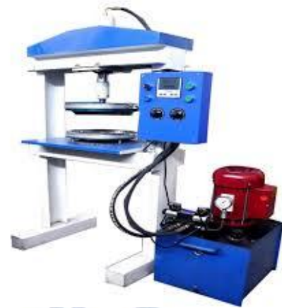
Fig. 1.3 Single Die Paper Plate Making Mach

This type of machine is designed to produce a single size and shape of paper plate. The machine has a single die, which cuts the paper into the desired shape. The machine is suitable for small-scale production and requires minimal human intervention.