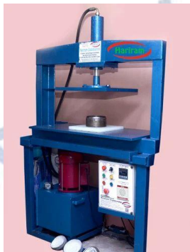
Fig. 1.1 Hydraulic Paper Plate Making Machine

This machine operates on a hydraulic system and can produce plates of various sizes and shapes. The hydraulic system provides the required pressure to cut and shape the paper plates. The machine uses a hydraulic motor and a hydraulic pump to generate the necessary force.