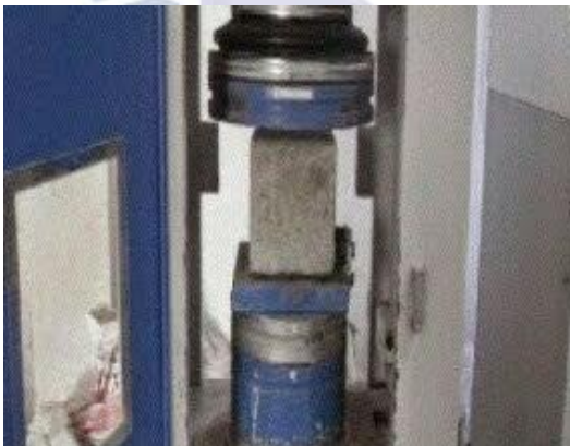
Fig 2: Compressive Strength Testing Machine Table 5

Comprehensive strength is finished at 7,14 and 24 days on concrete cube samples containing distinct possibilities of e-waste with the use of CTM. It turned into observation that the strength of concrete decrease with respect to e-waste. Comprehensive strength of e-waste plastic concrete is less than conventional concrete.