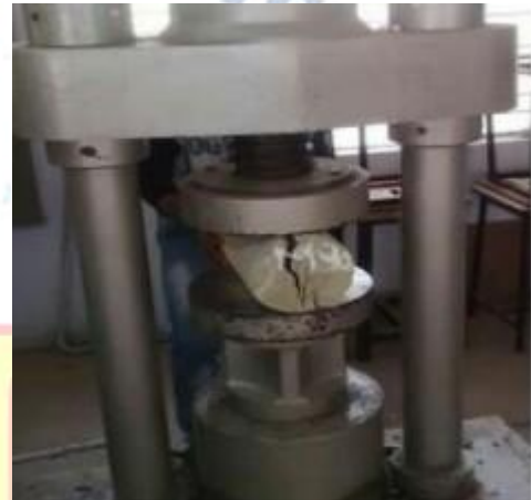
Fig 3: Split Tensile Strength Testing

Split tensile strength is achieved at 7,14 and 24 days on concrete cylinder samples containing different percentages of e-waste. It was discovered that the split tensile electricity of concrete decrease slightly with increasing e-waste plastic. Split tensile electricity of conventional concrete is more than e-waste plastic concrete.