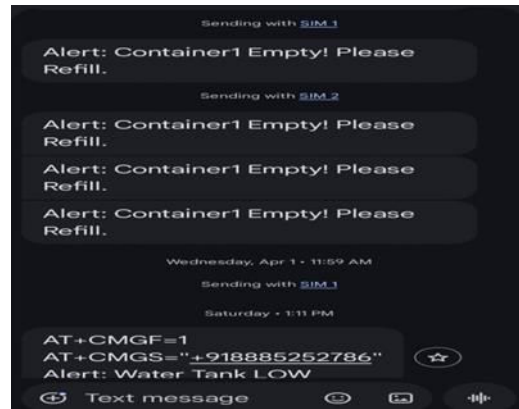
Fig. 5.2. Output 2

The overall performance of the system was stable, reliable, and efficient. It reduced manual effort, improved accuracy, and enhanced student safety. The results demonstrate that the system is effective for real-time transportation monitoring.