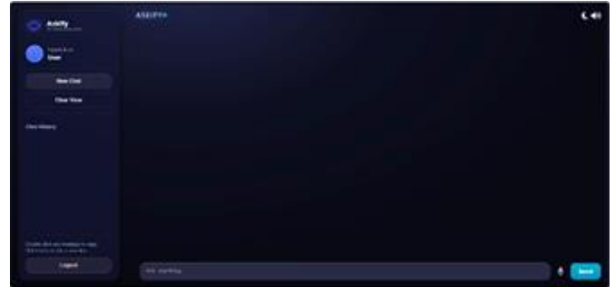
Figure3:interface of our system

programming assistant. It focuses exclusively on technical and coding-related queries, ensuring accuracy and relevance in responses. Unlike general-purpose chatbots, the system delivers domain-specific knowledge with structured explanations [5].