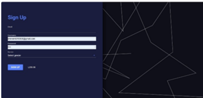
Figure2:sign up page of system

Figure 2 tells that Askify is a full-stack web application designed to function as an intelligent