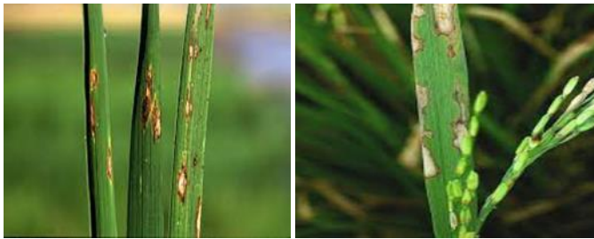
(a) Blast Disease

4. Brown Spot: Rice leaves are afflicted by Brown Spot, a foliar disease brought on by the fungus Cochliobolus . It results in tiny, oval-shaped lesions that have impaired photosynthesis and brown centers with yellow haloes on the leaf.