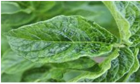
(d) Latent and mild mosaic viruses