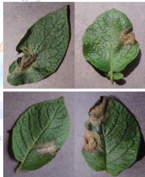
(b) Late Blight infected Potato leaf diseases