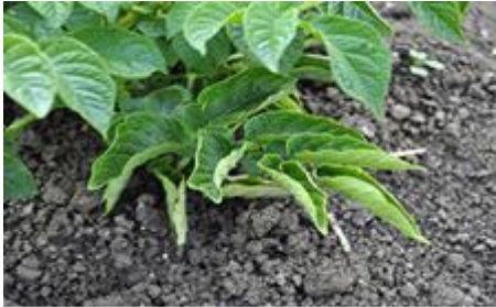
(e) Leafroll Virus