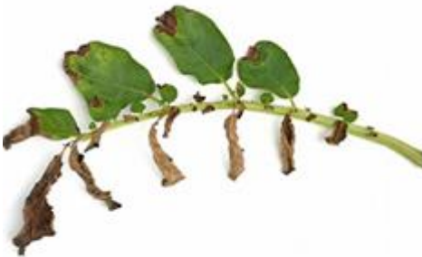
(f) Verticillium wilt