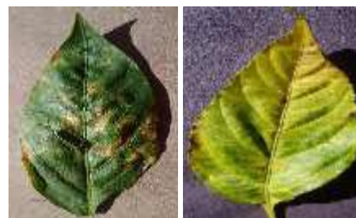
(c) Pepper bell Bacterial spot infected leaves