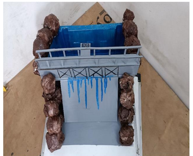
Fig. 3. 3D Physical Model of a Dam Structure (Side & Top -View)