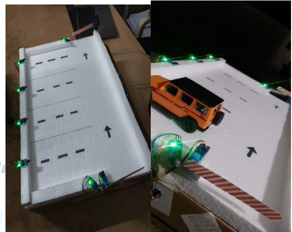
Figure 3: Prototype

The system demonstrated a slot detection accuracy of 98.6% across 500 simulated vehicle presence and absence events, with only 7 false readings attributed to ambient infrared interference under direct sunlight conditions. The average sensor response time recorded was 120 milliseconds, which is well within the acceptable threshold for real-time applications [3]. Gate actuation through the servo motors was achieved with a mean response latency of 310 milliseconds from trigger signal to full gate movement, ensuring smooth vehicular flow. The web interface reflected updated parking slot availability within an average of 1.8 seconds of a physical change in slot occupancy, confirming effective cloud synchronization [2]. The LCD display updated slot count within 200 milliseconds of any state change. Over the full 72-hour test window, system uptime was maintained at 99.1%, with only two brief disconnections lasting under 3 minutes each due to intermittent Wi-Fi fluctuation.