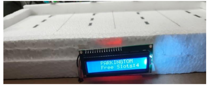
Figure 3: Prototype LCD output

The proposed IoT-Based Smart Car Parking System was implemented and evaluated in a controlled laboratory environment simulating a real-world parking facility with six designated parking slots. The hardware prototype comprised an ESP32 microcontroller operating at 240 MHz with dual-core architecture, six IR proximity sensors positioned at each parking bay, two micro servo motors controlling entry and exit gates, and a 16x2 LCD module interfaced via the I2C protocol. The system was connected to a cloud server through a Wi-Fi network operating at 2.4 GHz, and real-time slot status was reflected on the web application hosted at https://parkington.vercel.app/ . All experiments were conducted over a continuous 72-hour observation period with repeated vehicle entry and exit events to simulate realistic urban parking conditions. The firmware was programmed and flashed onto the ESP32 using the Arduino IDE, and web dashboard updates were monitored for latency and accuracy.