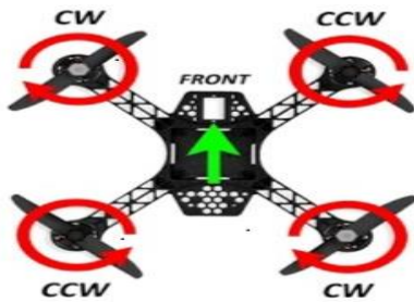
Fig. 3. Quadcopter drone motor rotation

For agility, the quadcopter must respond quickly by adjusting motor speeds to pitch forward for movement and backward for stopping, enabling fast acceleration, sharp turns, and reduced stopping distance. It is necessary so as to decrease the stopping distance. Secondly for the drone to be agile, the quadcopter must be able to turn quickly with a small turning radius.