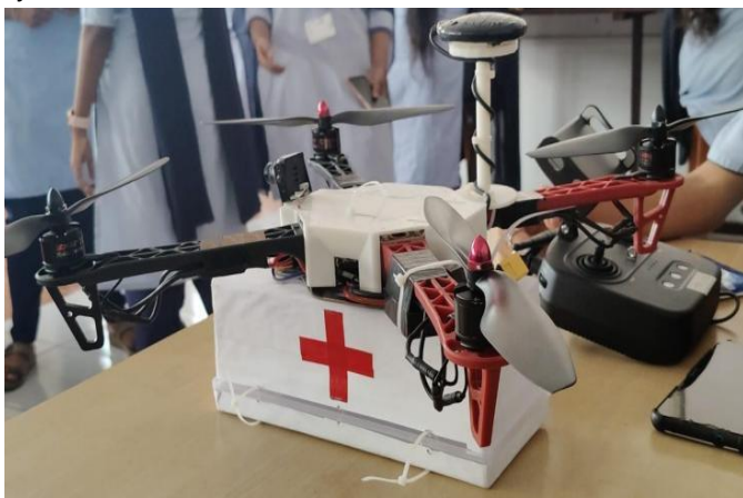
Fig. 1. Proposed Quadcopter drone

Secure all components using double-sided tape. Recheck all electrical connections, attach the top plate, and finally install the propellers on the motors and the fire detection system.